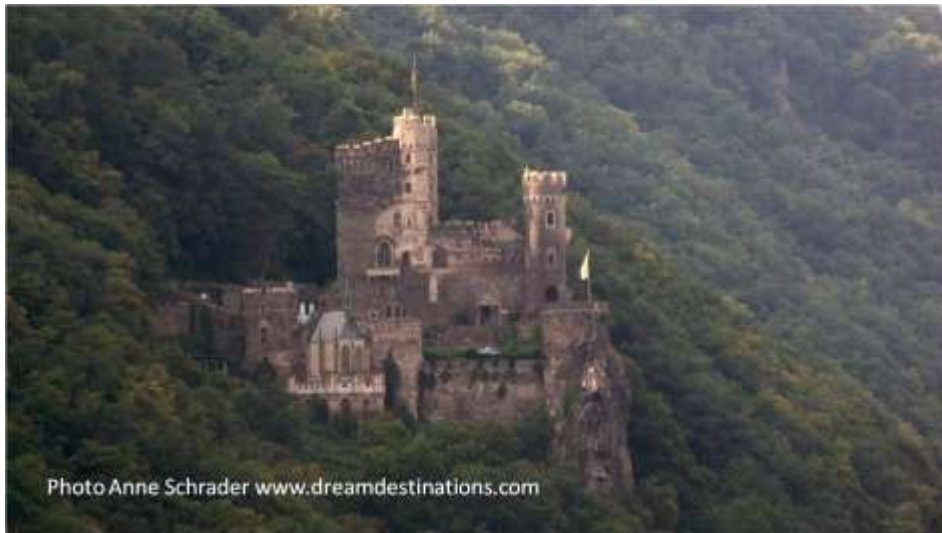
Rheinstein Castle, Rhine River Castles