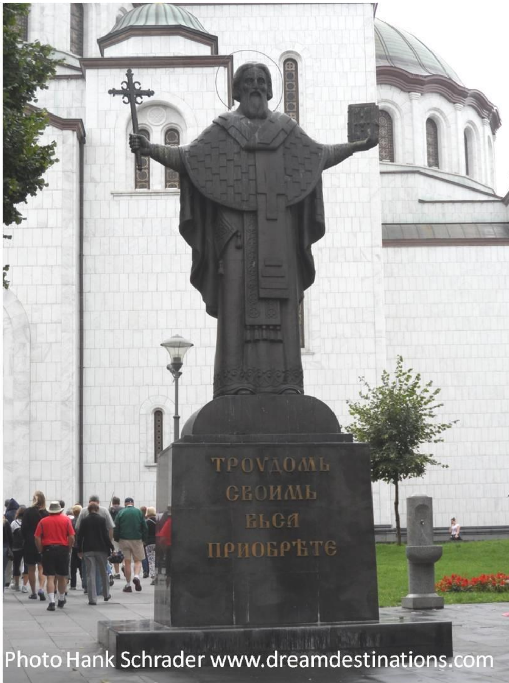
St. Sava Statue Belgrade, Serbia