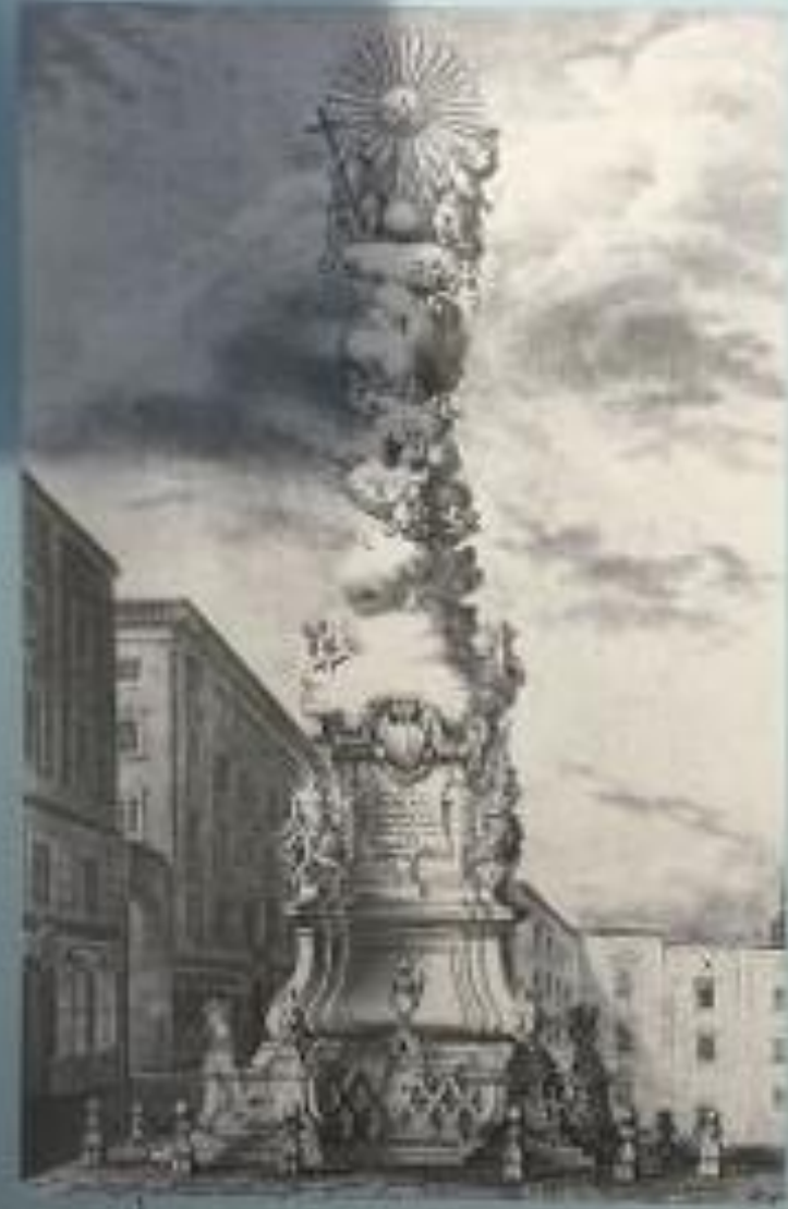
Illustration of the Trinity Column on a protective cover. Often key landmarks need to be protected or are under repair as the column was during our 2019 visit to Linz

Lithographie von Johann Haidinger ca. 1830