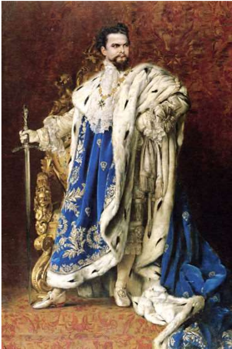
Portrait of King Ludwig II of Bavaria