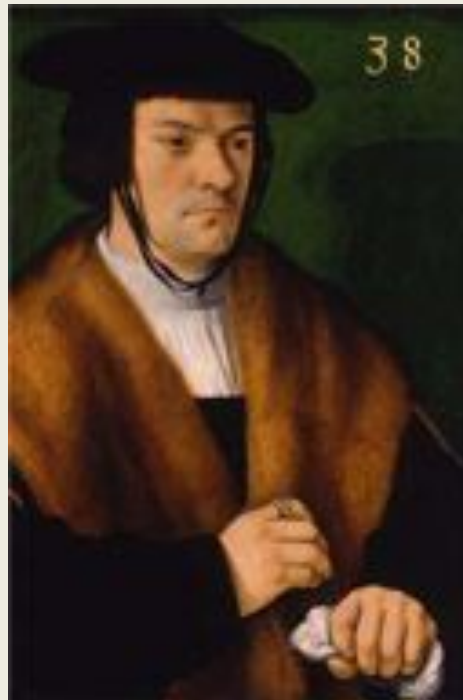
N Europe Collection