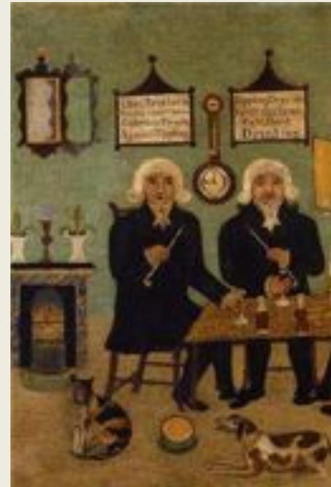
British Folk Art Collection