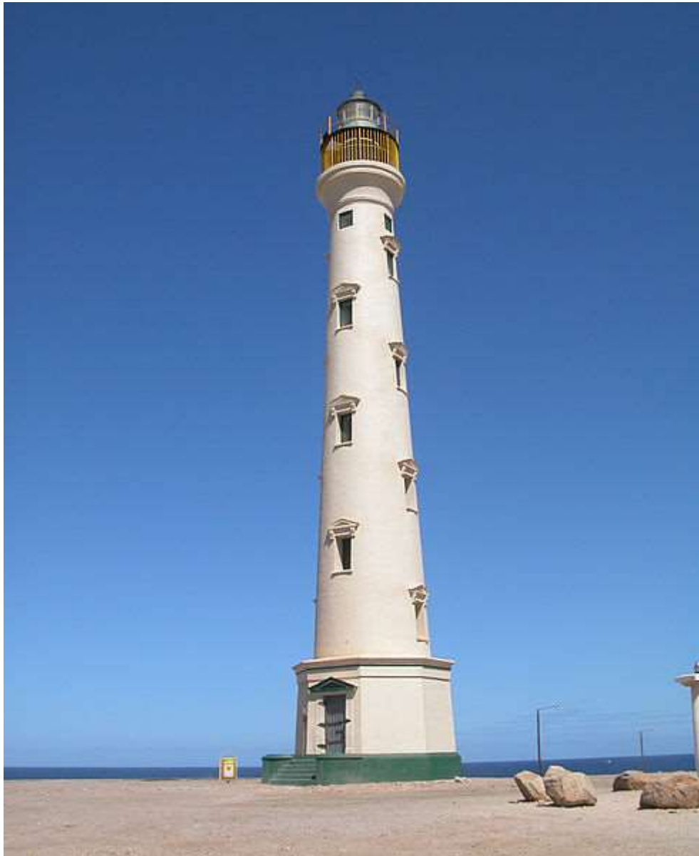
California Lighthouse