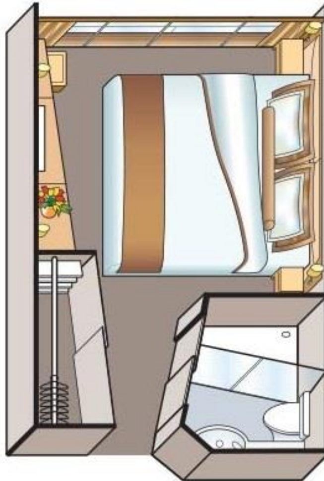
Diagram from Viking River Cruise