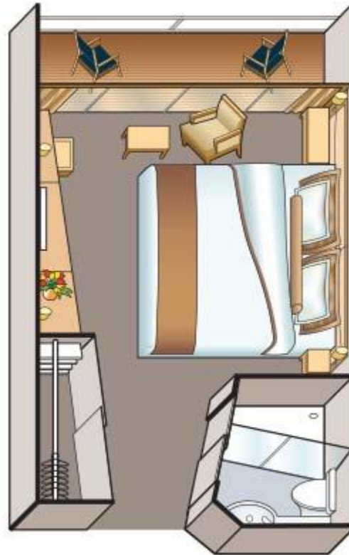
Diagram from Viking River Cruises