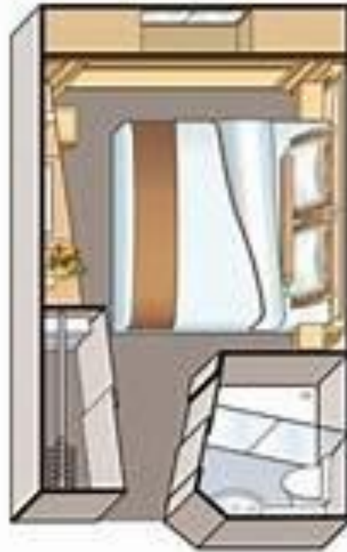
Diagram from Viking River Cruise

25 staterooms are fixed windows on the first deck.