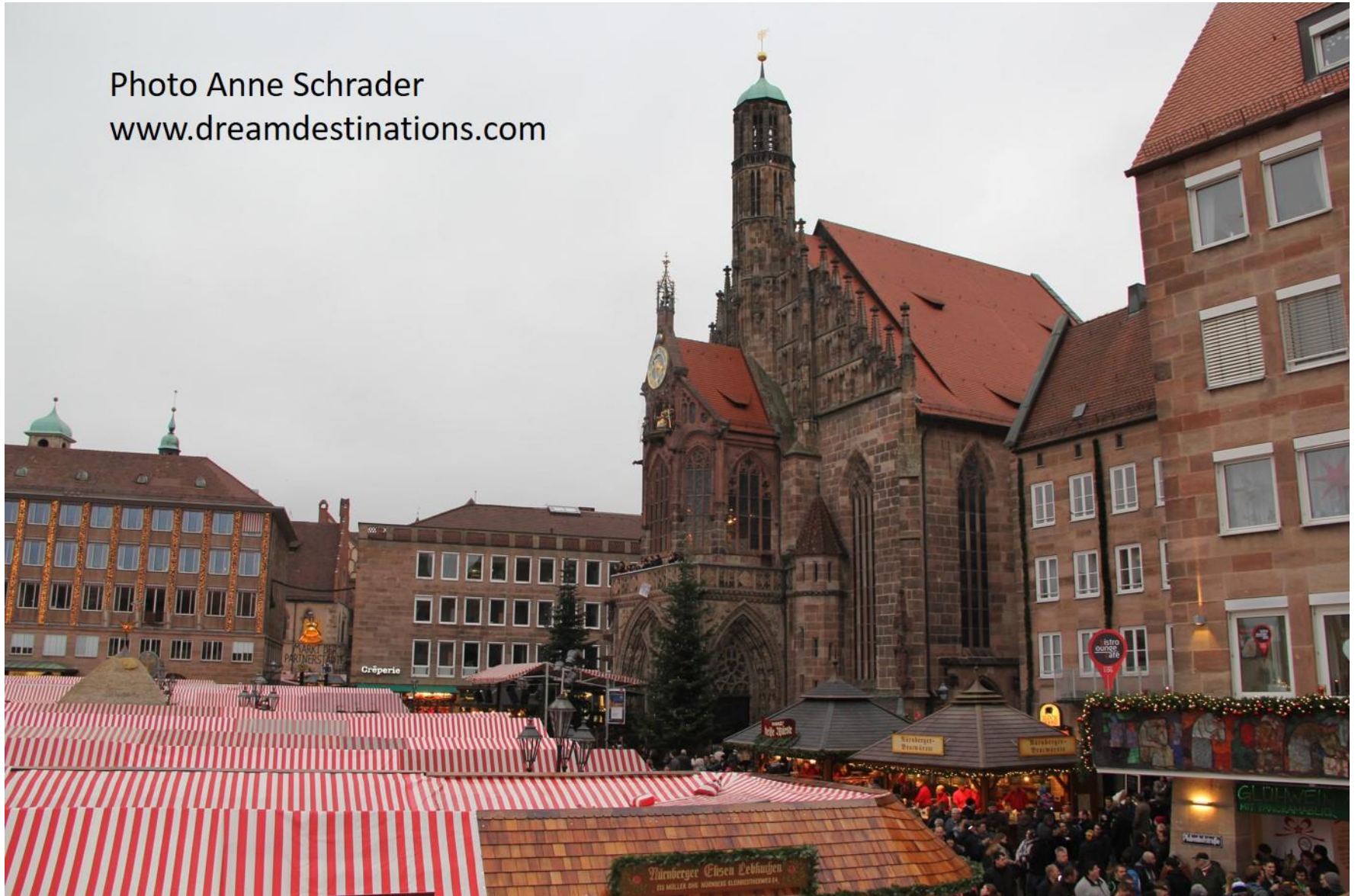
www.dreamdestinations.com