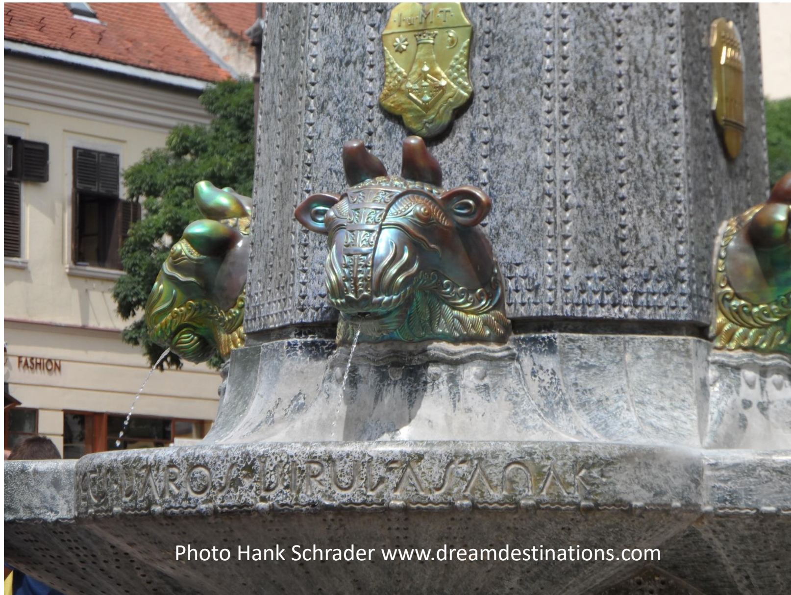
www.dreamdestinations.com