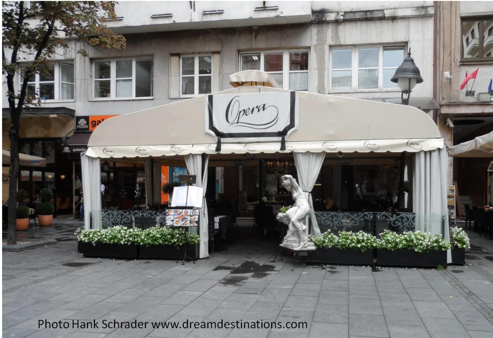
www.dreamdestinations.com