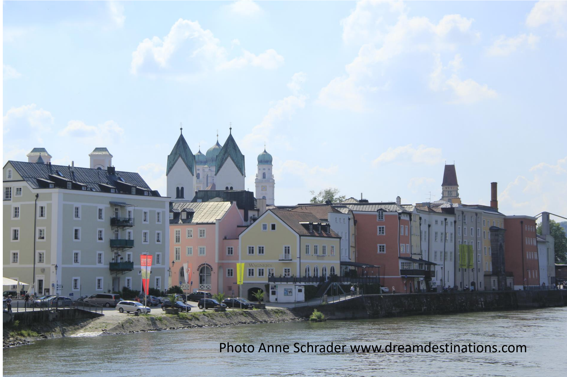
www.dreamdestinations.com