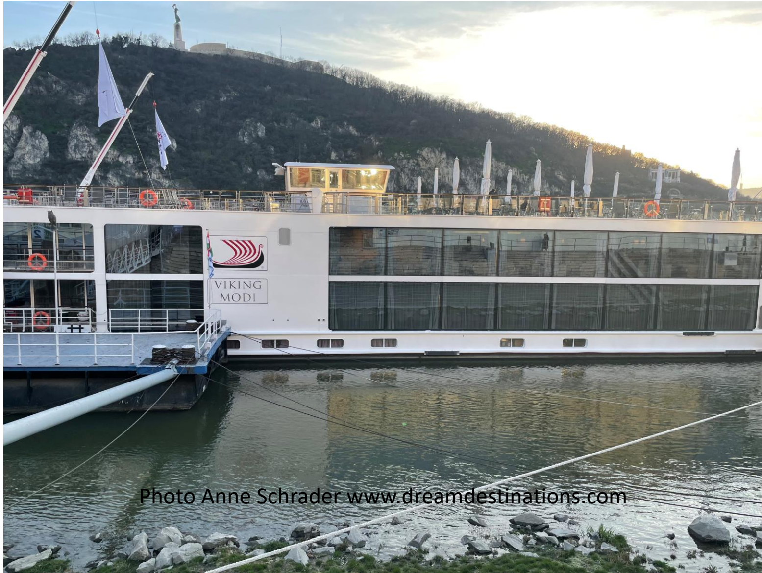
www.dreamdestinations.com